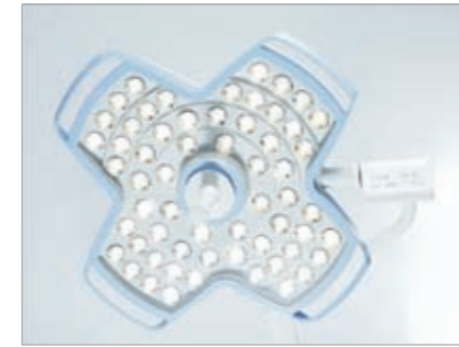
High quality LED bulb creates a homogenous light beam

With the mobile base and built-in battery supply, HyLED 9500M goes where you need it with excellent performance. Its ultra-agile and reliable suspensions offer precise positioning and superior maneuverability.