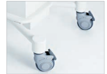
Four castors all with locking system provide stable base for the light