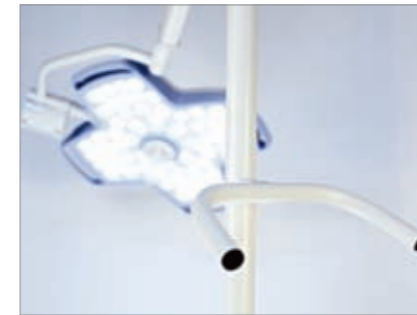
Simplicity design of the handle provides superior maneuverability