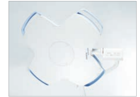
Cross shaped design for better shadow dilution and laminar flow compatibility