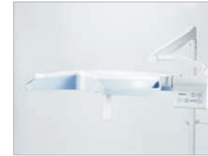
Really thin, the lateral profile of the light head