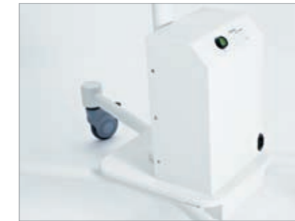
The ultra-agile mobile base provides maximum flexibility, with reliable battery power supply up to 1.5 hours